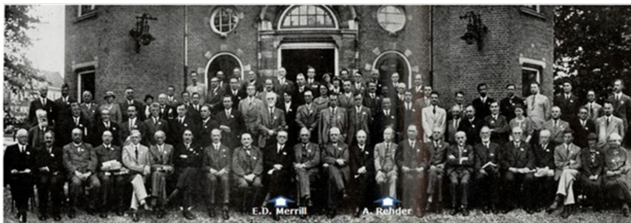
Sixth International Botanical Congress, Amsterdam, September 1935. Plant Taxonomy Section