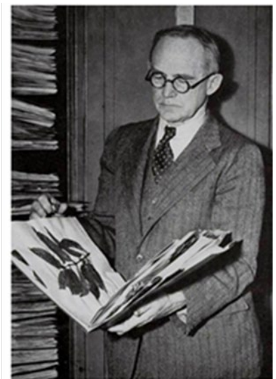
In the Arboretum's Herbarium c1940s